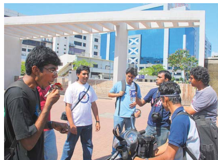
Photowalkers take a break at Tidel Park

There is a certain strength in numbers. The social aspect of the photowalk makes it easier for the amateurs to indulge in their hobby. Otherwise, mustering