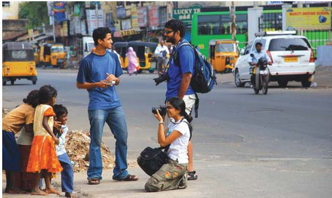
Above: The photowalkers find children smiling subjects. Right top: Crossing a road in a rush; Right middle, A view of the Adyar River and Estuary from the broken walkaway; and Right bottom: A boat in city waters.

Once a month, CCG leads devoted Chennaiites on a fun outing to shoot people and places in the city. The idea is to walk through a neighbourhood and capture in pictures – the buildings, the people on the streets, and the very ethos of the place. Photowalkers also chat with long-time residents to learn the lore of the locality. At the end of the self-guided heritage walk, they post their digital snapshots on flickr.com.